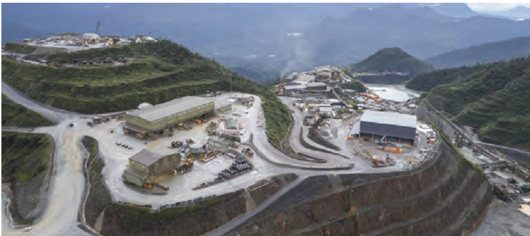
Ok Tedi operations office at Mt Fubilan, Western Province.

Ok Tedi Mining Limited (OTML) notes recent public commentary regarding the CMCA Extension Agreement (EA) 2012 and related matters. These issues are currently before the Court. OTML respects the legal process and will not comment on the merits while proceedings remain sub judice.