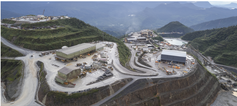
Ok Tedi operations office at Mt Fubilan, Western Province.

Ok Tedi Mining Limited (OTML) notes recent public commentary regarding the CMCA Extension Agreement (EA) 2012 and related matters. These issues are currently before the Court. OTML respects the legal process and will not comment on the merits while proceedings remain sub judice.