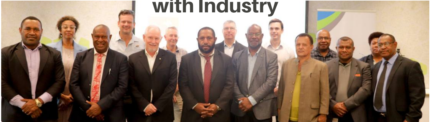
Mining Minister Muguwa Dilu (Centre) and mining sector representatives at the industry meeting.

The Mining industry in Papua New Guinea remains a key focus of Government, in ensuring that maximum benefits are realized, for all stakeholders.