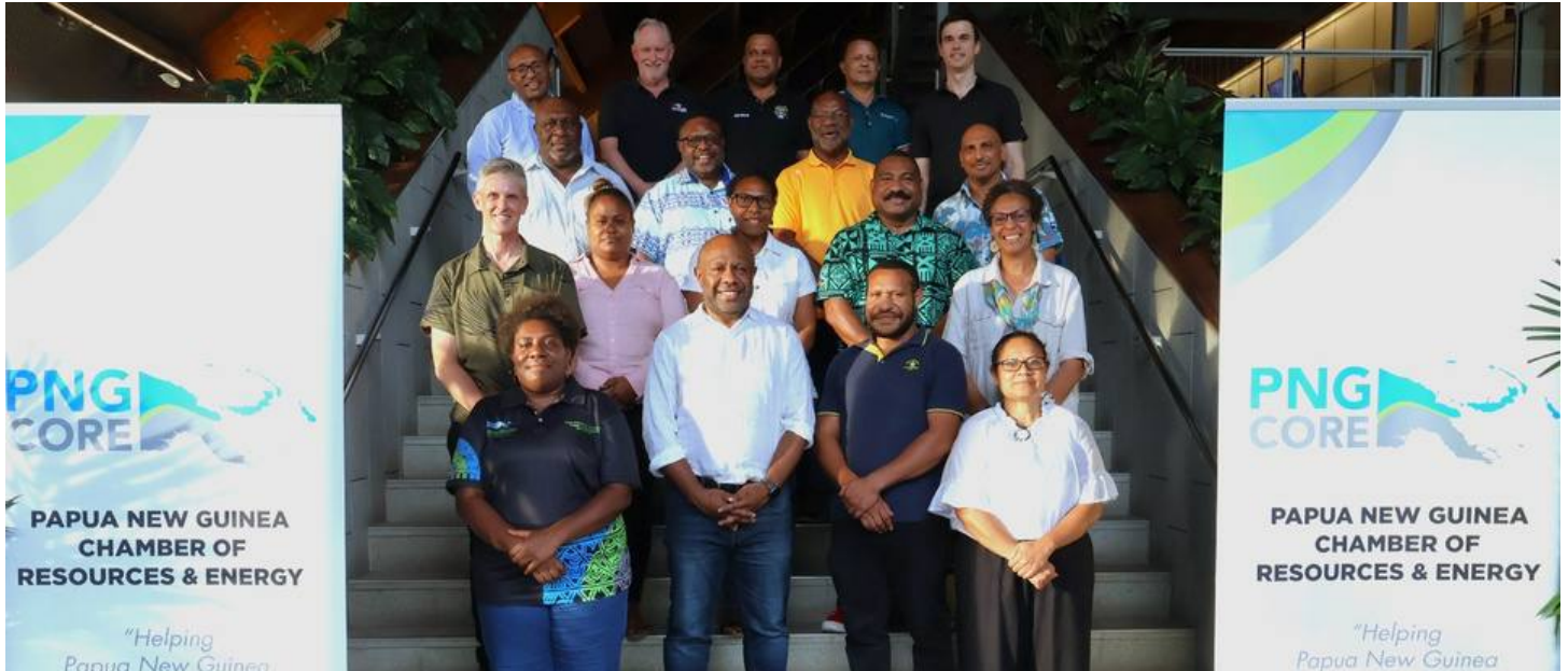
PNG CORE Councillors, Committee members, and Senior Management who took part in the Strategic Intent Agenda Review Workshop.

In line with efforts to continuously improve its offering to members, and stakeholders PNG CORE recently conducted a review of its Strategic Intent Agenda.