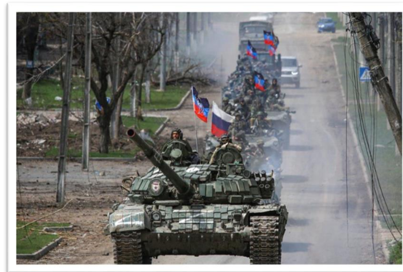
Russian tanks in Ukraine