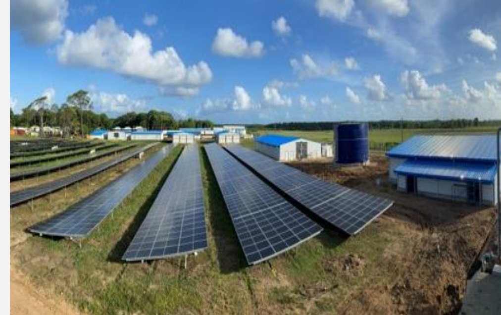
Top: Daru solar farm. Below: Solar battery storage