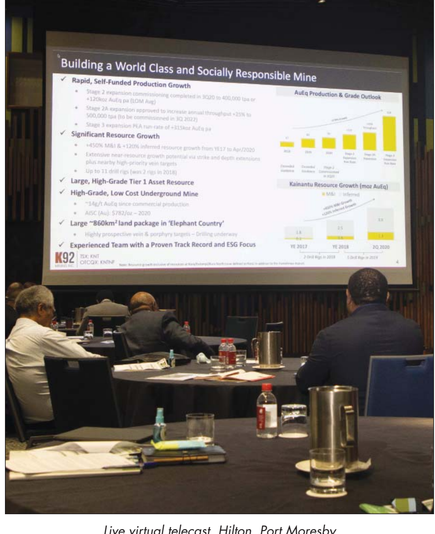
Live virtual telecast, Hilton, Port Moresby