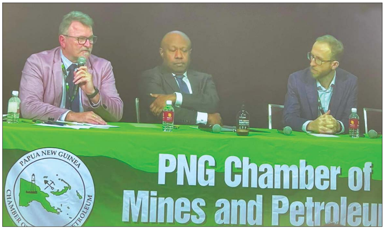
Live virtual telecast, Hilton, Brisbane