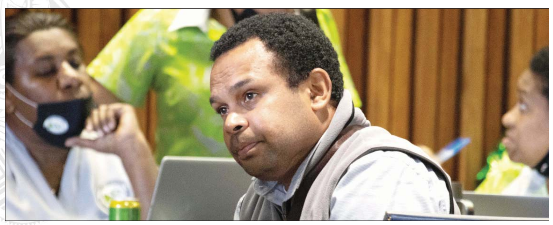
The Chamber's Administration at the 2021 Conference, Hilton, Port Mort Moresby

The impact is lower demand for oil, as people are travelling less, or at least travelling shorter distances.