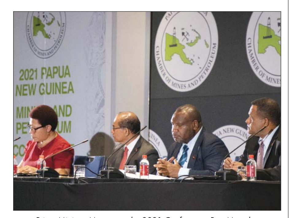
Prime Minister Marape at the 2021 Conference, Port Moresby

There is considerable uncertainty at present over policy issues and the potential impacts of Covid-19 and Climate Change. However, this conference will reinforce the view that, combined with some assurance of a more stable regulatory and fiscal regime, PNG can steer a course that will lead to a renewal of investor interest in mining and petroleum activities.